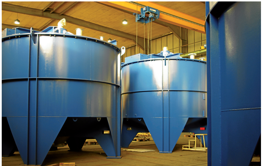
The Lohse waste pulpers during production.

The BTS company, located in the South Tyrolean city of Bruneck, commissioned LOHSE to manufacture a complete wet processing system for organic waste, to be used in Bari. The total order volume