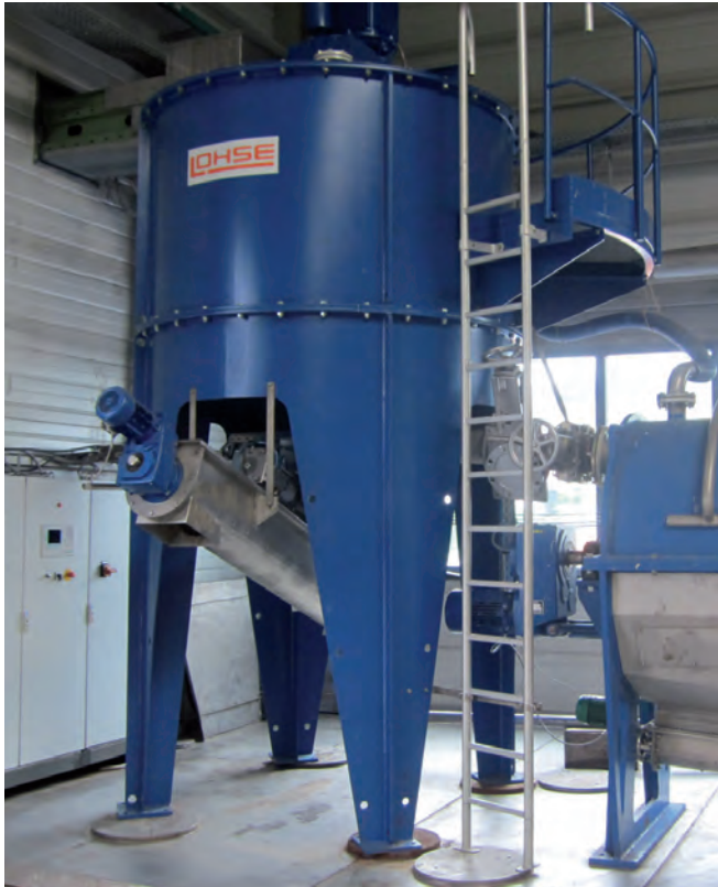
LMC4 + LMC6 with base of steel construction