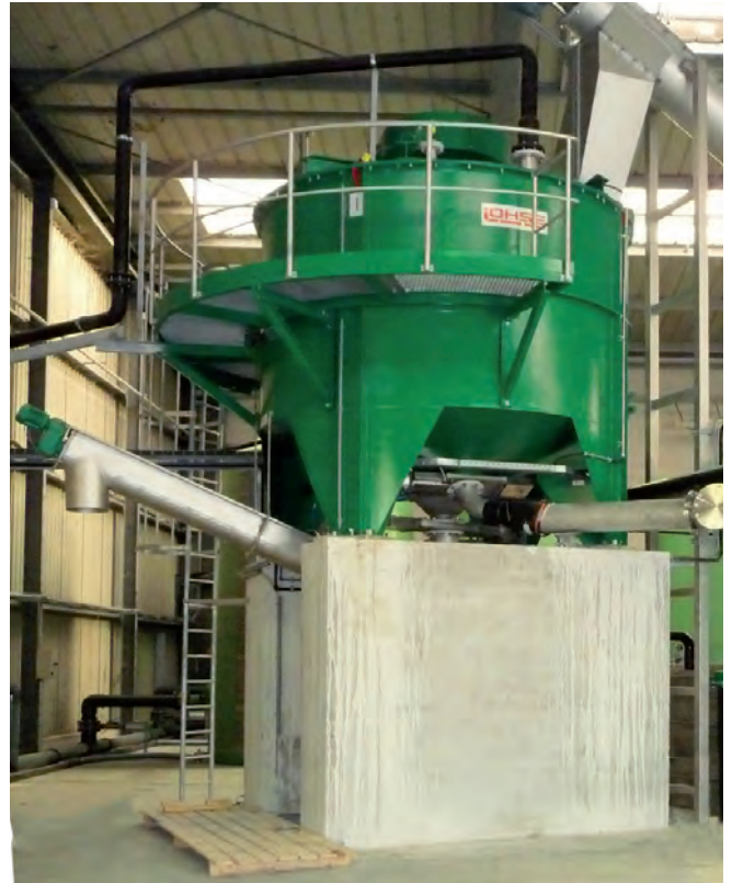
from LMC8 with base of concrete